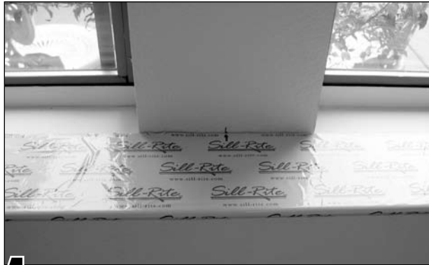
4 Set the sill on the shims and line up the center line you marked on the sill with the line you marked on the wall in step 2.

Make sure you read and understand these instructions before beginning your installation.